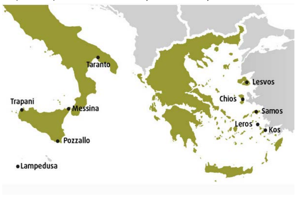
Figure 2 – Map of hotspots in Greece and Italy as of February 2018